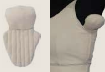
Mini Axilla Pad