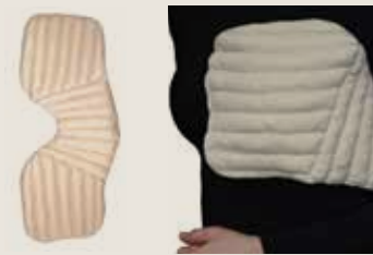
Unilateral Post-Mastectomy Pad