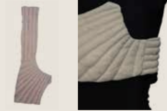
Chest-wall Pocket Pad