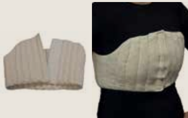
Double Mastectomy Pad