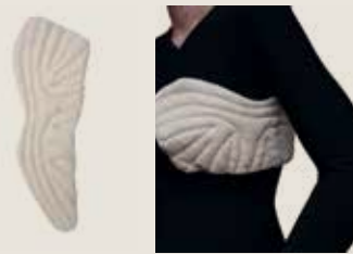
Serratus Anterior Pad